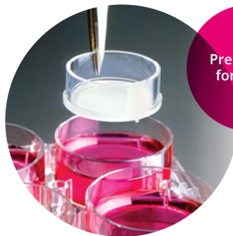
Preparation for dosing