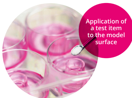
Application of a test item to the model surface